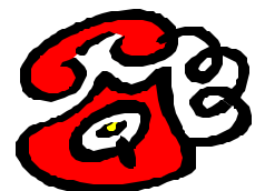
Imagine voicemail in Heaven? What a concept...! NO THANKS...

"I'm sorry...all of our angels and saints are busy helping other sinners right now. Your prayer is important to us..."