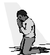
Pray without ceasing

Well, the moment has finally arrived—the war has actually started in Afghanistan. Prayer warriors, it's time to seek the Lord and ask for His hand of guidance and protection. Many of us in the prayer group live in both the UK and US, the two nations at the forefront of this military strike.