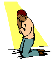
God works with you, not for you

The Lord shall increase you more and more, you and your children. Ye are blessed of the Lord which made heaven and earth. Psalms 115:14-15.